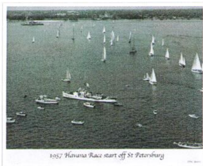
1957 Havana start

A race of legendary history, the regatta's first seeds of concept lay in the late 1920's, when St. Petersburg, Florida, was experiencing the effects of the Great Depression and Prohibition. But just a sail away in Havana, Cuba, rum was flowing and nightlife flourishing.